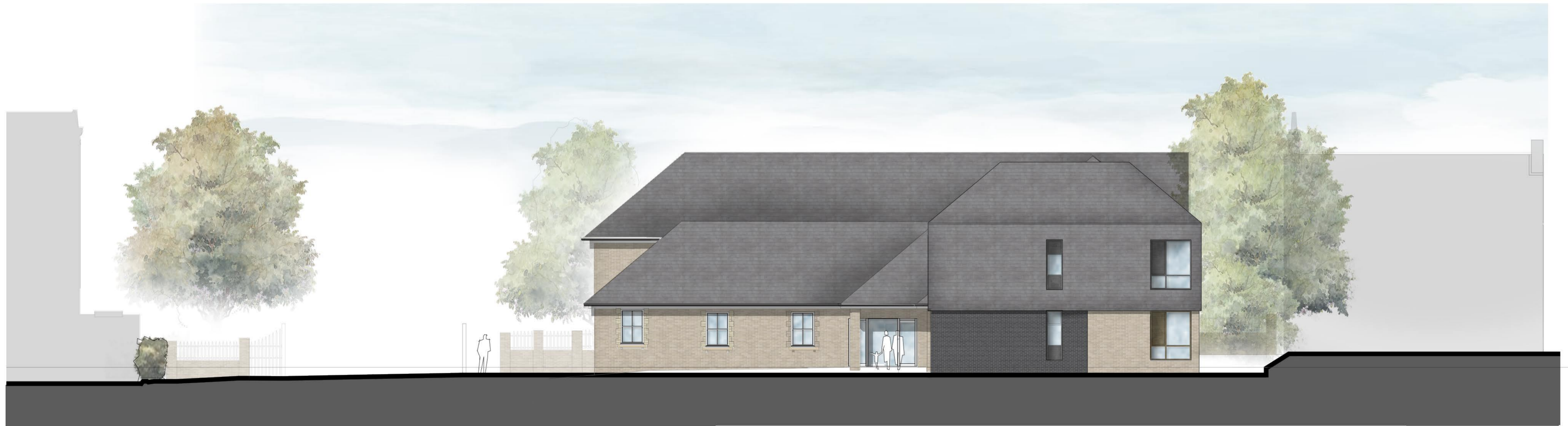
North-West Elevation as Existing 1:100

20 Newton Road | Existing Car Park | Existing Entrance Gate | Existing Car Park | Newton Place Surgery | Proposed Extension | Side Path and Landscape | 32 and 34 Newton Road